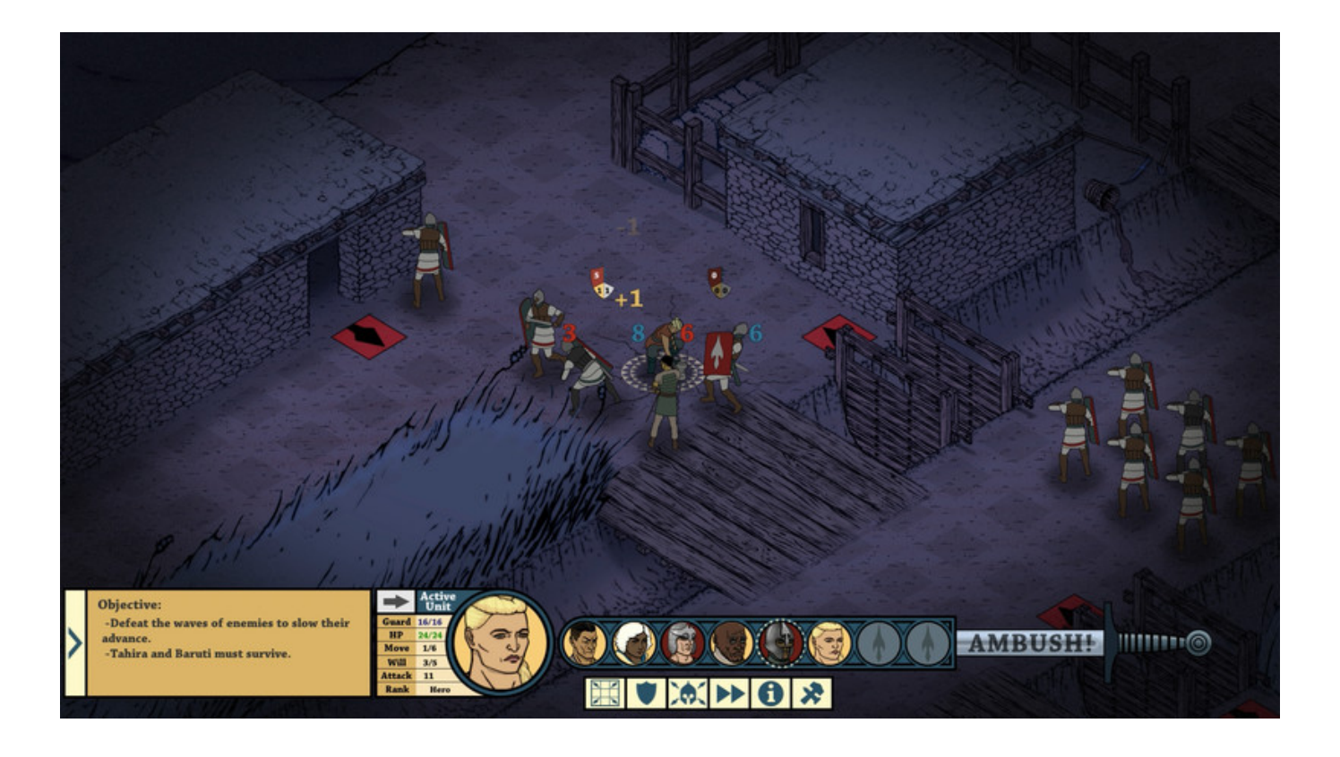
Three Days Torrent Download [crack]

Download >>> <a href="http://bit.ly/2SJTAWX">http://bit.ly/2SJTAWX</a>